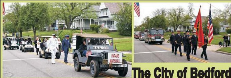
The City of Bedford