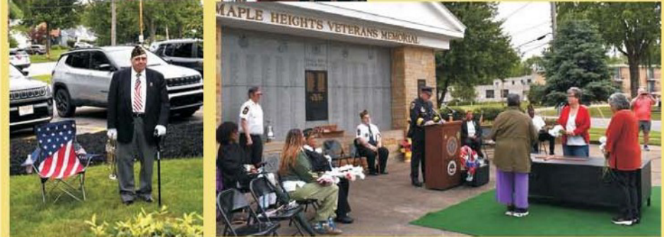
The City of Maple Heights