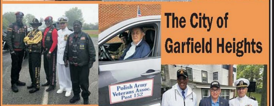
The City of Garfield Heights