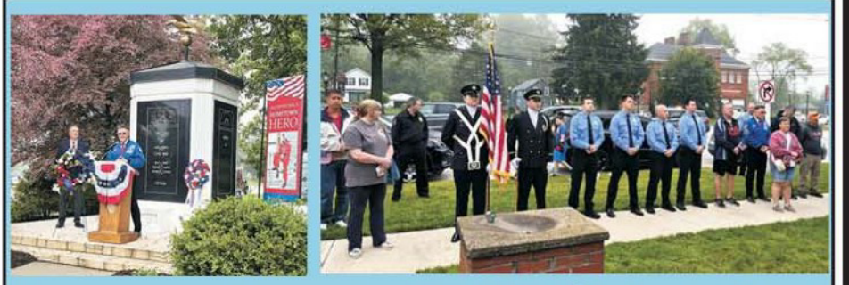
The City of Independence