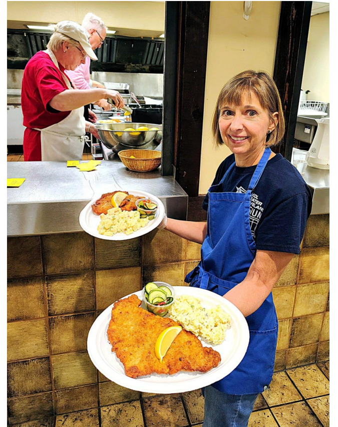
Shown here is a Sokol volunteer serving up the mouthwatering pork schnitzel and potato salad last Sunday at Bohemian National Hall, in the North Broadway area of Slavic Village.

Dinners are open to the public with reservations. Check this newspaper in the next couple weeks for the May offering.