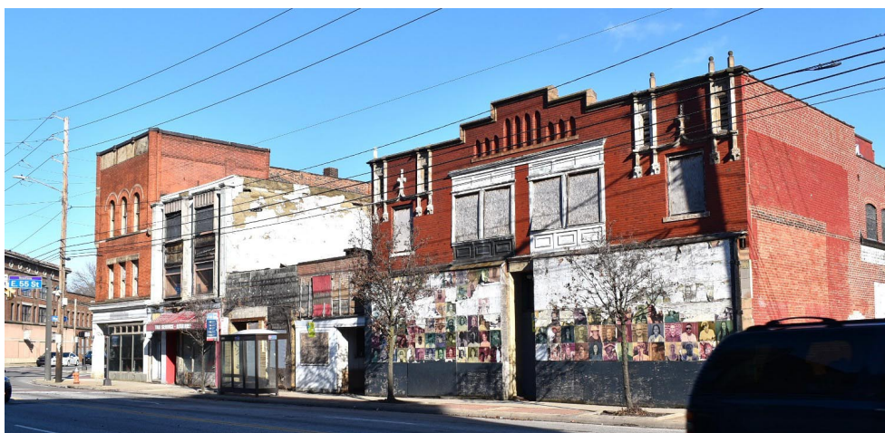
Columbia Savings and Loan Co. building, 5601 Broadway Ave., Cleveland

The credits were awarded as part of the Ohio Historic Preservation Tax Credit Program, which provides financial incentives for the private redevelopment of Ohio's historic buildings.