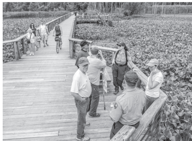
CVNP visitors are shown at the popular Beaver Marsh along the Ohio & Erie Canal Towpath Trail.

The National Park Service report, 2023 National Park Visitor Spending Effects, finds that the lodging sector had the highest direct contributions with $9.9 billion in economic output and 89,200 jobs. The restaurants received the next greatest direct contributions with $5.2 billion in economic output and 68,600 jobs.