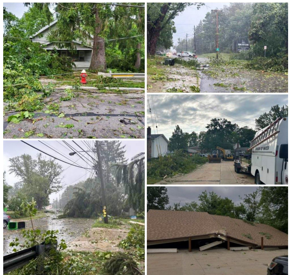
Shown are scenes taken in Bedford after a devastating tornado hit the area August 6th. (Taken from city of Bedford Facebook posting.)