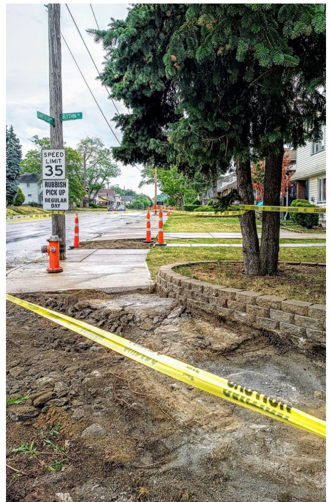
Sidewalk work began yesterday on the Garfield Boulevard Rehabilitation Project shown here at the Boulevard and Blythin Rd.