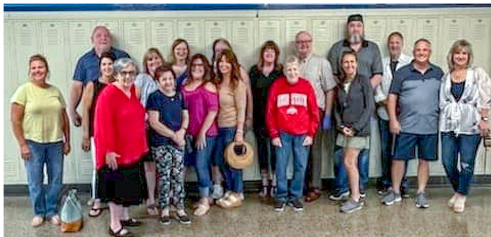
Shown above are members of the GHHS Class of '84 who celebrated their 40-year reunion on Saturday, June 8, with a tour of their former high school and at a nearby restaurant later in the afternoon.

The celebration continued later in the afternoon at a nearby restaurant. The GHHS Class of 1984 extends its sincerest thanks to the Garfield Heights Board of Education for their support of this event.