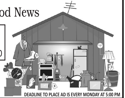
DEADLINE TO PLACE AD IS EVERY MONDAY AT 5:00 PM

To Place an Ad, Call 216-441-2141 or Email: nnews1923@aol.com