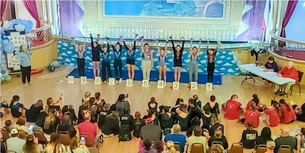
The North East Ohio Girls League Championships were held at Sokol Greater Cleveland in the North Broadway neighborhood May 10-12, attracting over 1,000 visitors and nearly 500 gymnasts. "Congratulations to all the gymnasts competing at Sokol, and a special thanks to the volunteers and parents for making this Amateur Athletic Union event such a huge success," said Sokol officials.