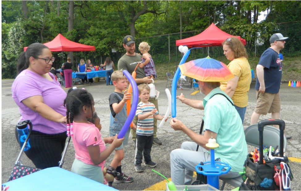
There were lots of fun things for the little ones at the Memorial Weekend celebrations at the Garfield Heights Civic Center, culminating Monday with a parade to the Veterans Memorial. Shown above are some of the kids watching a balloon artist make balloon animals for them to take home.