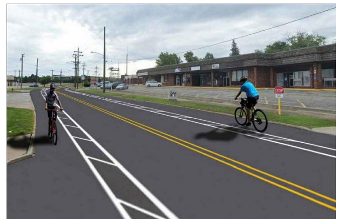
Reimagined Southgate Park Blvd. in Maple Heights

The Ohio Department of Transportation, in concurrence with NOACA, will have the role of oversight over the Southgate Park Boulevard Improvement Project. The city will work with ODOT to expedite the process and hopes to have the project ready for the 2025 construction season.