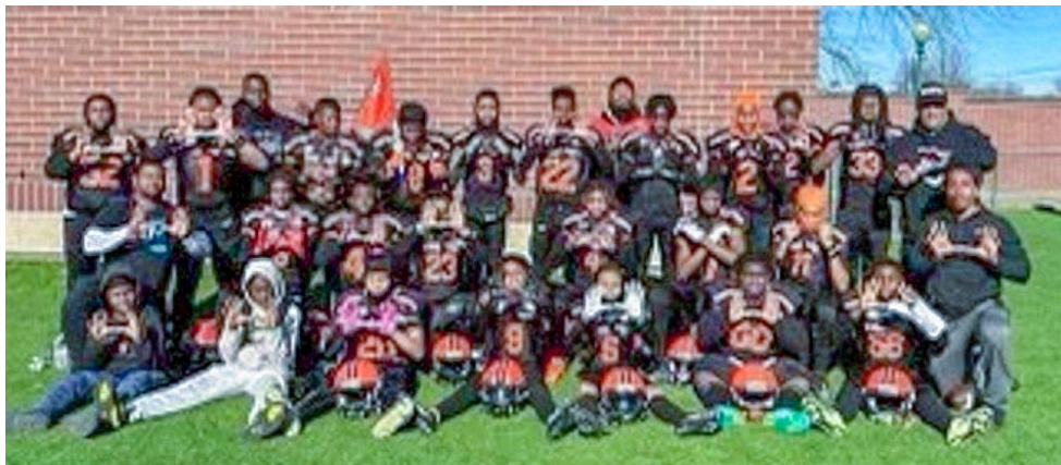
The undefeated 12U Maple Heights Saints are headed to Orlando to compete for the National Championship.