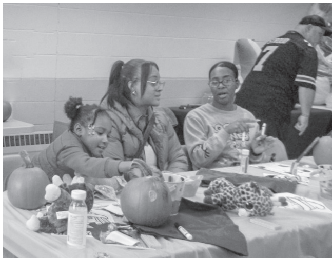
Pumpkin decorating was only one of the fun things to do at the Garfield Heights Civic Center last Saturday, as residents celebrated Fall Family Funday. There was also music and dancing, food, crafts for kids, raffles and other seasonal activities for the whole family.