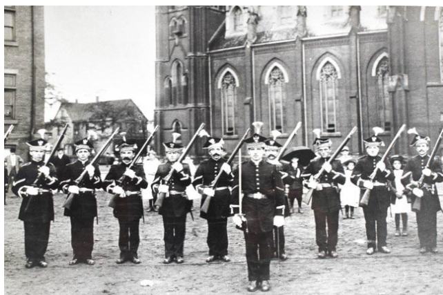
Shown here are members of the Polish Army practicing drills in the St. Stanislaus School yard in 1912. At least 500 Polish patriots from St. Stan's Parish joined the Polish Army and fought in Europe in World War I.