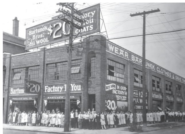
The skilled workers of Bartunek Brothers on E. 66th St. and Union Ave., are lined up in front of the plant where they make suits, overcoats and topcoats, selling for about $20 each.

Not a single clue regarding the murders identity has been uncovered.