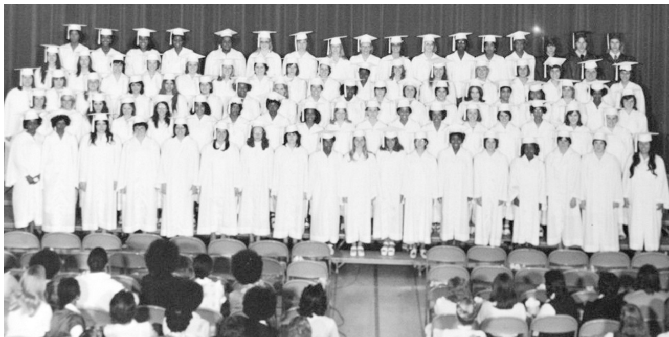
Shown above are members of the Trinity High School Graduating Class of 1973/74, the first class that graduated boys (all three of them) after the school's first year of becoming co-educational.

We look forward to a successful and celebratory school year as one of Northeast Ohio's best-known and respected Catholic high schools as we continue to put God at the center of all we do.