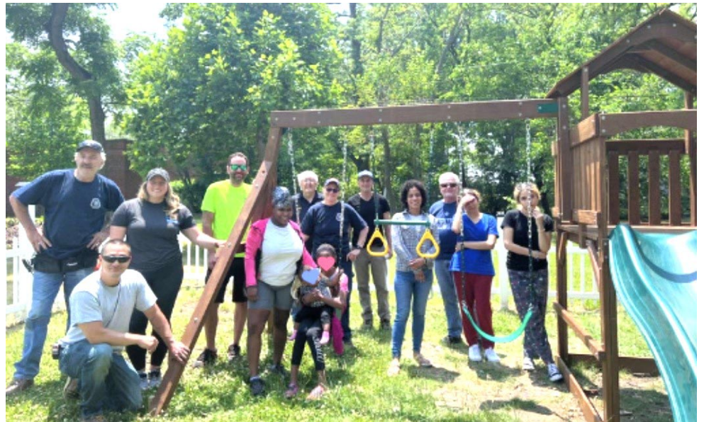
Shown above with the completed playground set are volunteers from the carpenter's unions, St. Bernadette's K of C, and SE Kiwanians who joined forces to make the lives of the kids at The Haven Home on the city's southeast side a little brighter.

SE Kiwanis extends its sincere appreciation to the carpenter's unions and St. Bernadette Knights of Columbus and their own membership for a collaborative effort that will put smiles on children's faces at The Haven Home for years to come.