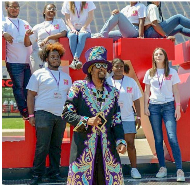
Bootsy Collins poses with Garfield Heights Music Express students at the Cleveland Rock and Roll Hall of Fame.