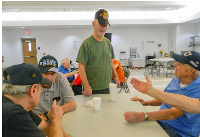
Old friends and new ones enjoyed a complimentary breakfast for Garfield Heights veterans recently at the Garfield Heights Civic Center in appreciation for their service.