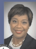
Annette M. Blackwell Mayor of Maple Heights