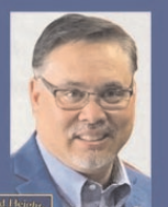
Matt Burke Mayor of Garfield Heights