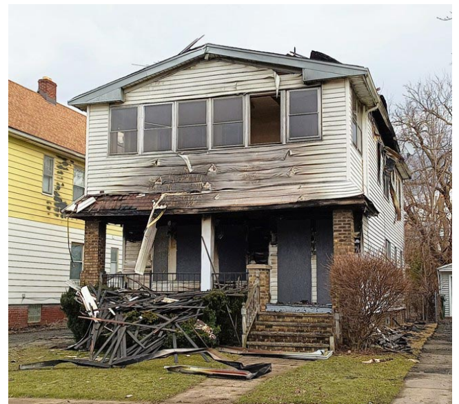
This home on E. 84 St., Garfield Heights, was gutted by flames early Tuesday morning. The sole occupant of the house was taken to safety by a GHPD patrolman who spotted the fire, but several pets perished.

Warner said it was thought the fire started on the first floor of the double home, with flames blazing all the way up to the roof. The Ohio State Fire Marshal's