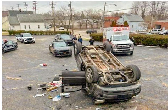
Valley View police were pursuing this car northbound on E. 71 St., when it flipped and landed upside down in a parking lot at E. 71 St. and Grant Ave., in Cuyahoga Heights. Above is a picture of the Chevy Equinox involved, taken by a Newburgh Heights police officer.