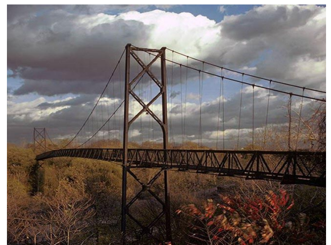
Sidaway Bridge as it looks today.