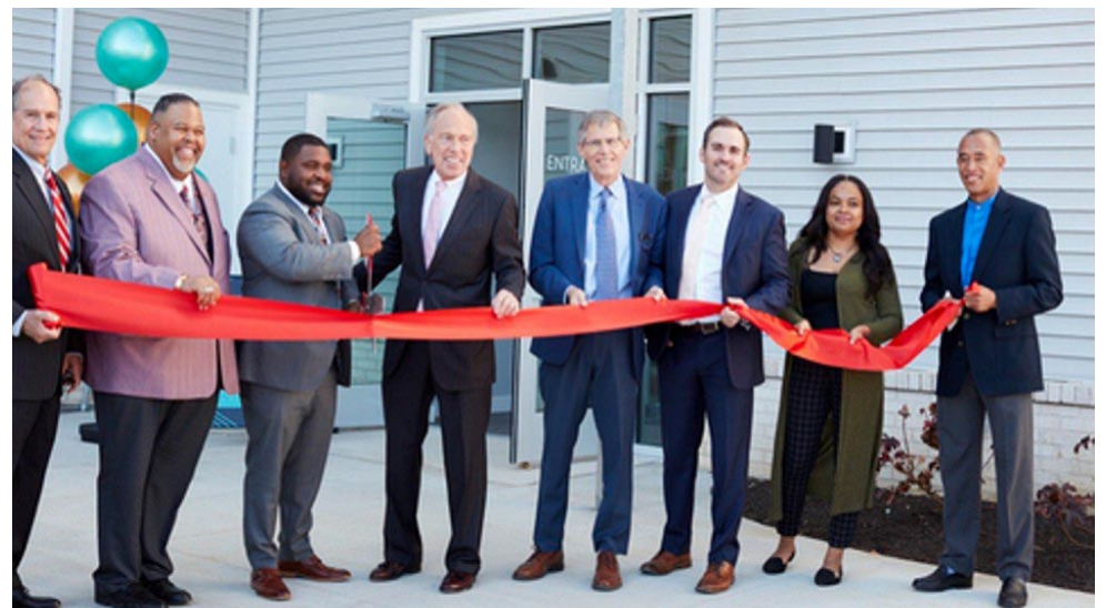
Local officials and representatives from University Settlement and The NRP Group celebrated the grand opening of 5115 at The Rising, an affordable housing community located in the Broadway-Slavic Village neighborhood of Cleveland on Monday, Nov. 14.