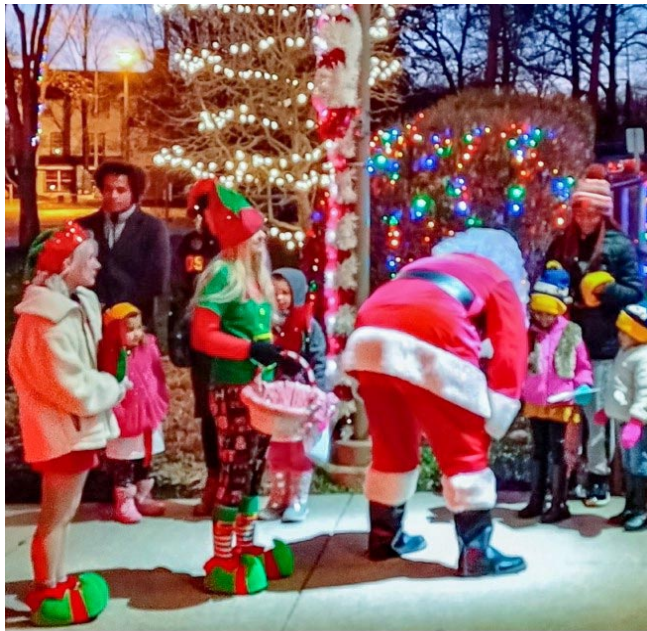
Santa was on hand for the Tree Lighting, arriving on a fire truck to the Civic Center. He had a jolly time greeting the youngsters eager to meet him.