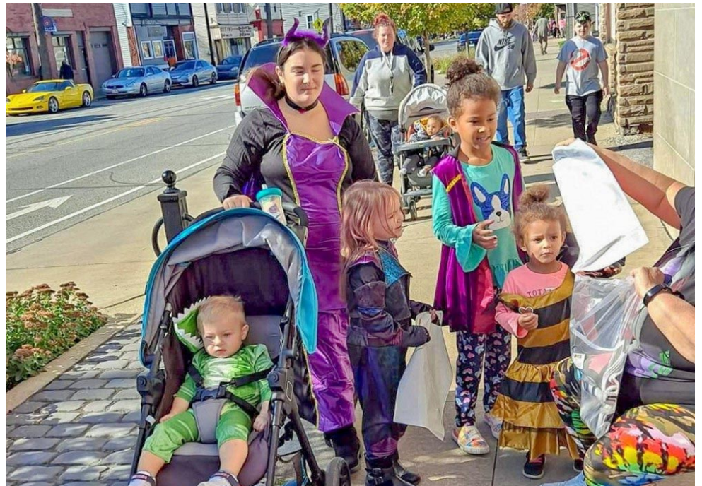
HALLOWEEN FUN ON FLEET..... It was a picture perfect fall day in Slavic Village last Saturday for the Trick or Treat on Fleet, sponsored by the Community Yahoos. Kids of all ages enjoyed free candy, like those shown in the photo above.