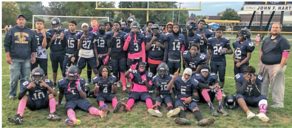
The 2022 freshman Garfield Heights Bulldogs football team and coaches