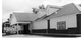
"A Cleveland Empowerment Zone Business"

7120 Cedar Ave. Cleveland, Ohio 44103 216-431-9205