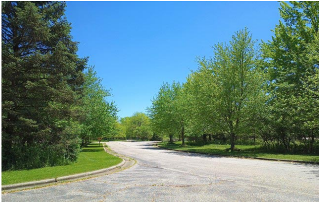
Shown is the property at 17500 Rockside Rd., Bedford, near the border of Maple Heights, where the state of Ohio has proposed to build a juvenile correction facility.