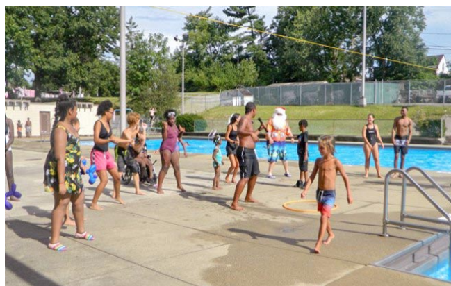
Santa gets in on the fun at the Christmas in July event last Saturday at the Garfield Heights pool.

The third community engagement opportunity for the Garfield Heights Master Plan will be held on Wednesday, July 27, at 6 p.m., at the Garfield Heights Civic Center, 5407 Turney Rd. It will also be live-streamed for those who wish to participate virtually.