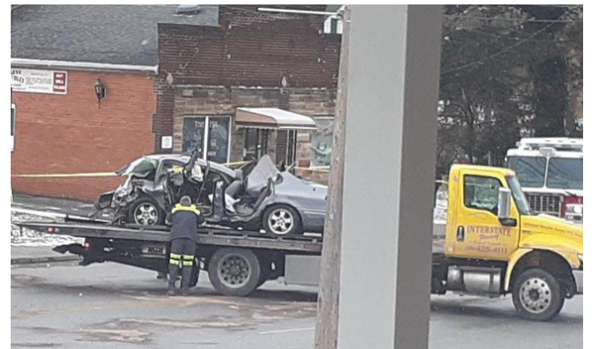
Interstate was dispatched to tow away vehicles from the crash site on Turney Rd. at Wallingford where two fatalities were reported recently in Garfield Heights.

SEALE Accident Investigation Unit is handling the crash investigation. Video surveillance of the accident was uploaded to the police report.