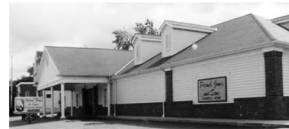
"A Cleveland Empowerment Zone Business"