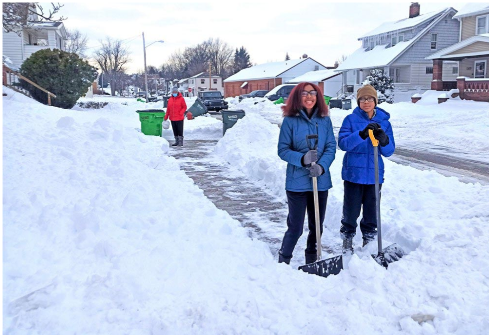
There was a lot of shoveling going on Tuesday after the storm Monday that left over 12 inches of snow over the Garfield Heights area and most of Northeast Ohio. But it didn't seem to faze these two teenagers on E. 93 St., who were most certainly up to the task.