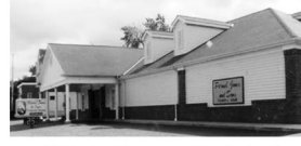
"A Cleveland Empowerment Zone Business"

7120 Cedar Ave. Cleveland, Ohio 44103 216-431-9205