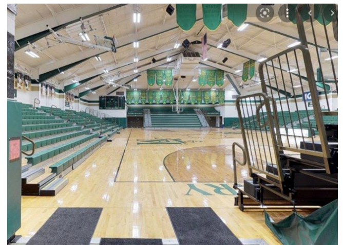
The gymnasium at the old South High is already sporting the green and gold colors of St. Vincent-St. Mary High for the new LeBron James movie "Shooting Stars."