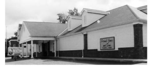
"A Cleveland Empowerment Zone Business"

7120 Cedar Ave. Cleveland, Ohio 44103 216-431-9205