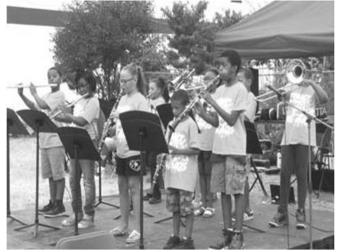
Literacy Through the Arts Summer Camp children are shown performing at an annual concert in pre-COVID days. This one took place behind Holy Name Church in 2017 that gave parents, grandparents and friends a chance to see what their little ones had learned over the course of the summer instruction.