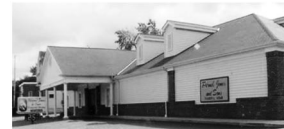
"A Cleveland Empowerment Zone Business"