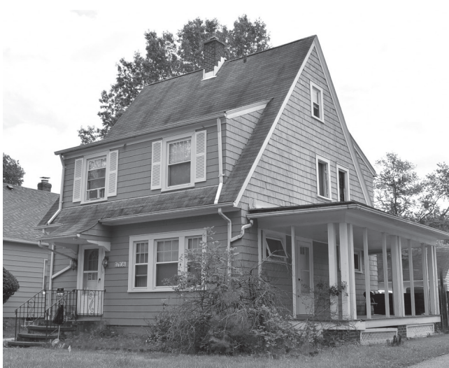
This house was the scene of a fatal fire Monday on Maple Heights Boulevard in Maple Heights.

The Maple Heights Fire Department personnel arrived and located a 62-year-old male victim. They provided first aid and transported the man to Bedford Medical Center, where he succumbed to his injuries. Maple Hts. police have not yet released the name of the victim.