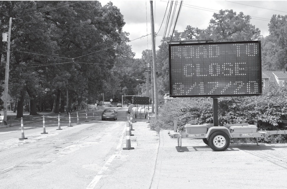
This bridge, between Garfield Pkwy. and Henry St. in Garfield Heights, will be closed for approximately 45 days beginning Aug. 17.