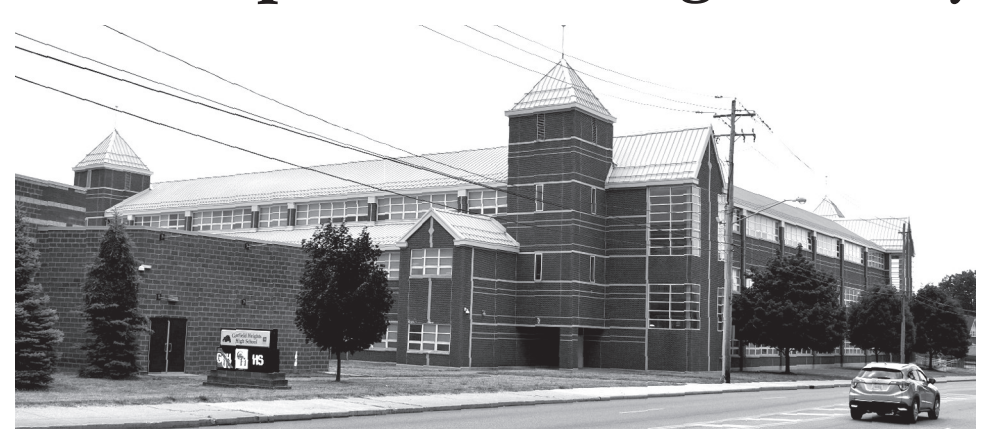
Brick-and-mortar schools like Garfield Heights High may be optional this year in Garfield Heights with the District's establishment of the Bulldog Digital Academy.

After surveying parents, district officials said more than 61% said they would be interested in having their children attend school Since some families have