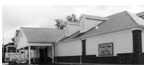
"A Cleveland Empowerment Zone Business"

7120 Cedar Ave. Cleveland, Ohio 44103 216-431-9205