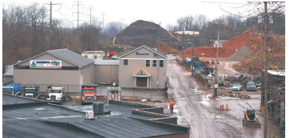
Baumann's Recycling Center in Garfield Heights has been held in contempt of court for not following an order to make this massive debris pile on its property smaller.

Firefighters were called to the recycling center in January 2019 after an excavator caught fire on top of the pile. The conditions at the site were so poor that the Ohio Environmental Protection Agency, City of Garfield Heights and the Cuyahoga County Board of Health referred the case to the attorney general's office for enforcement.