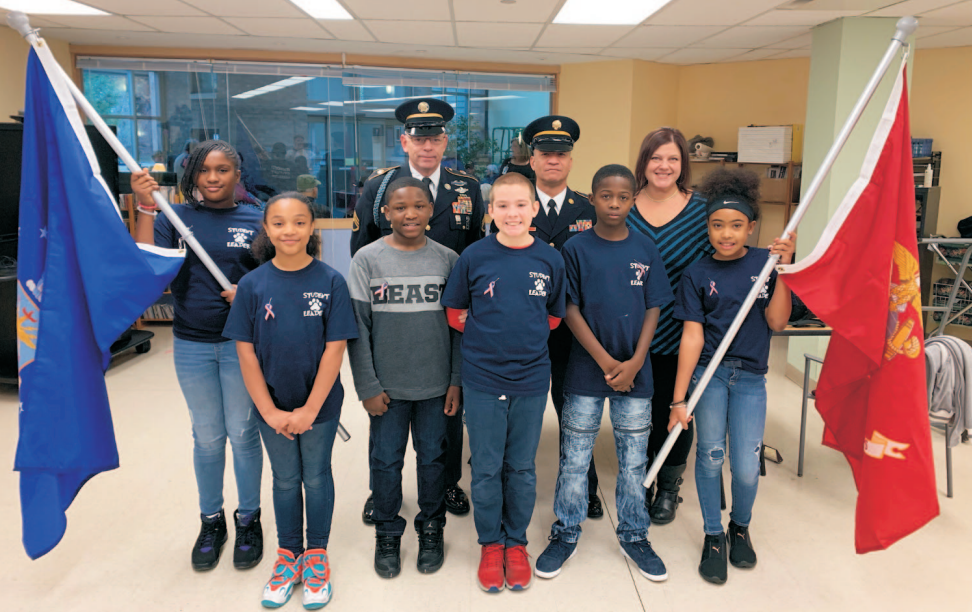
Elmwood Elementary School ambassadors are shown with military veterans at Jennings Home’s annual Veterans Day program at their Garfield Heights facility.

The annual 2019 Shop With A Cop raffle tickets are now available through the Garfield Heights Police Department. This event is very special to the children and families who are unable to afford clothes or gifts at Christmas. If you are interested in purchasing tickets, please stop by the Records Department at the Garfield Heights Police Department, 5555 Turney Road, Monday-Friday, 7:30 a.m. - 4 p.m. Tickets are $1.00 each or 6 for $5.00. There will be a drawing held on Thursday, December 19, to win the Grand Prize - 50" color television; 2nd Prize – IPAD; and 3rd Prize - $100.00.