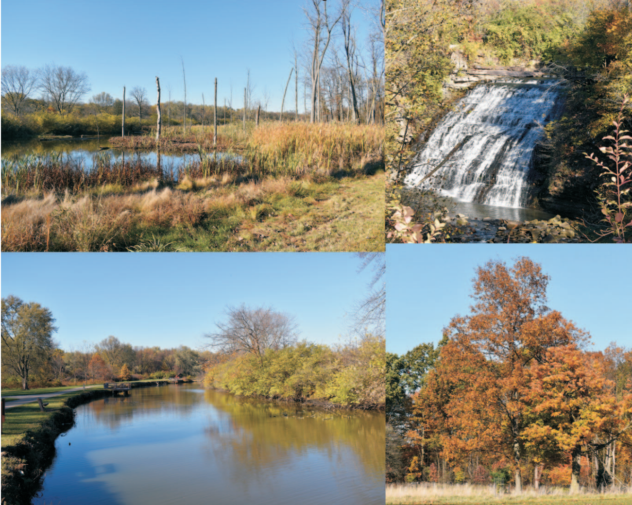
Shown above are fall foliage scenes from three Cleveland Metroparks reservations in all their autumn splendor: Garfield Park in Garfield Heights, Mill Creek Falls in Slavic Village and the Ohio & Erie Canal in Cuyahoga Heights.

FALL BACK! Daylight Saving Time Ends This Sunday at 2 A.M. Set Your Clocks Back One Hour Before Going to Bed.