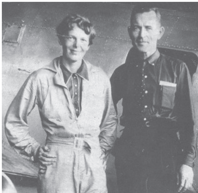
Shown are pilot Amelia Earhart and her navigator, Fred Noonan, before their ill-fated attempt to fly around the world.

Amelia Earhart was the first woman to fly across the Atlantic Ocean and to fly across the Atlantic solo, in addition to many more "firsts" for the female aviatrix. But she still wanted one more big adventure - to fly around the world.