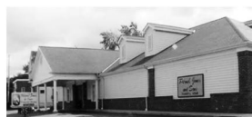
"A Cleveland Empowerment Zone Business"