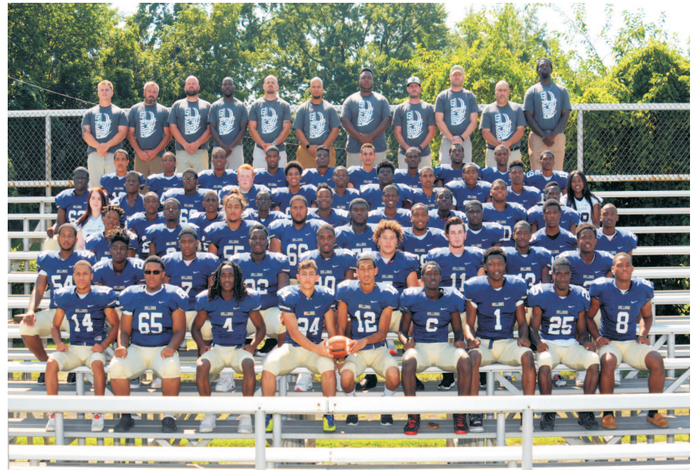
Garfield Heights High School 2018 varsity football team and coaches

lic (5-5) at Cuyahoga Heights this Saturday, Nov. 3, at 7 p.m.