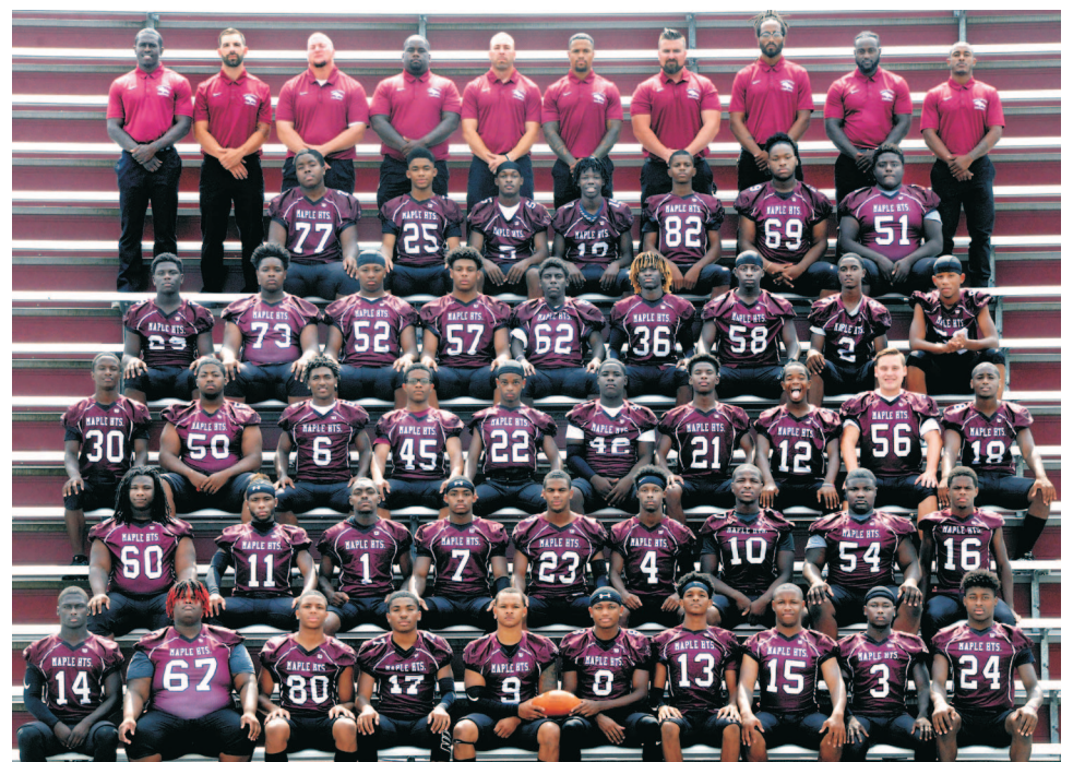
Maple Heights High School 2018 varsity football team and coaches

ELECTION DAY IS NOVEMBER 6th - REMEMBER TO VOTE!!!