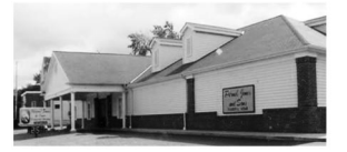
"A Cleveland Empowerment Zone Business"