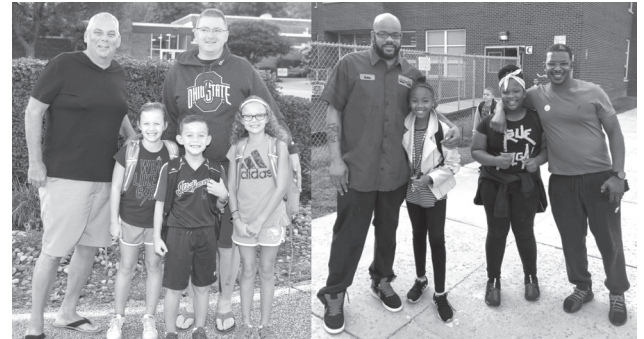
Shown here at left are Father's Walk participants heading to Independence Primary School, and at right, fathers at William Foster Elementary School in Garfield Heights walk their daughters to school.

What a wonderful way for fathers and father figures throughout our communities to highlight the roles of fathers in a child's education and the value of learning and importance of reaching their potential.