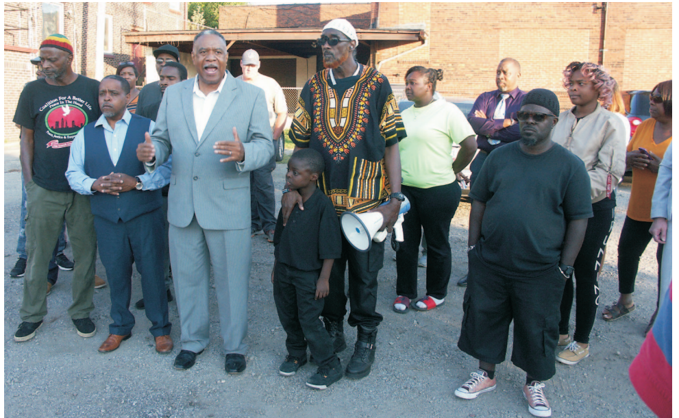
Above, a second vigil was held for a 31-year-old woman found dead outside the Broadway Christian Church on Engle Avenue the same evening.