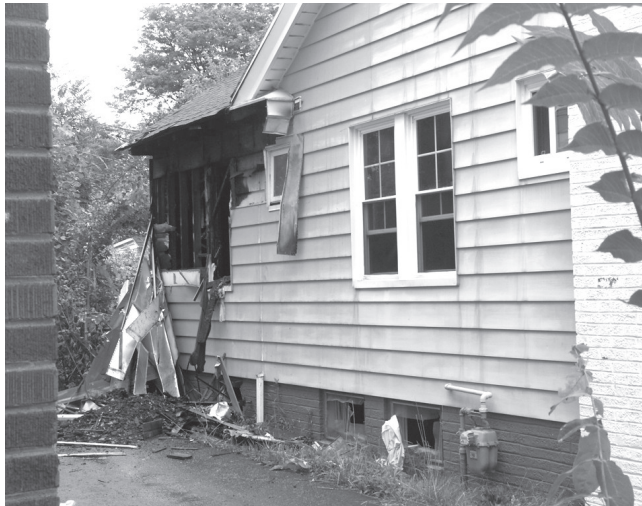
Garfield Heights police and fire officials, along with state and city fire marshals, are investigating a suspected arson at 4886 E. 97 St., shown above, reported on Tuesday, Aug. 7, along with another fire next door which occurred Sunday.

Children and their parents are encouraged to stop by. In addition to school supplies, representatives from a number of community-based resources will be on hand to answer your questions and provide valuable information for students and their families.