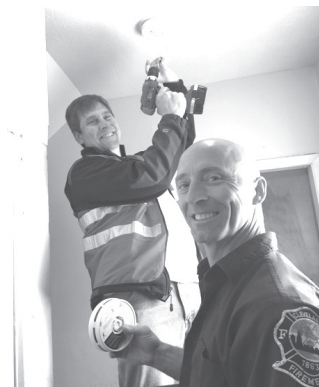
Volunteers are shown installing a free smoke alarm in this Slavic Village home last Saturday.

than 150,000 homes, and the number of deaths caused by fire has decreased almost 90 percent.