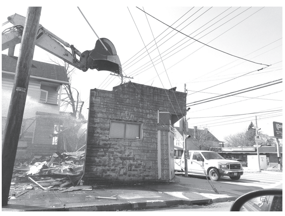
The old Polish Village bar, at the corner of East 71st and Fullerton in Slavic Village, was demolished last Friday, after years of the building being vacant and deteriorated. Civic leaders hope to restore its iconic sign and find a home for it somewhere along Fleet Avenue.