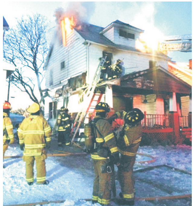
House fire on E. 84th St., Garfield Heights

The next afternoon, January 14, around 3:50 p.m., the Garfield Heights Fire Department was called to a house fire in the 4800 block of E. 84 St., and called Maple Heights, Valley View and Cuyahoga Heights squads for mutual aid. A large fire could be seen on the first floor with heavy smoke conditions on the upper floors.