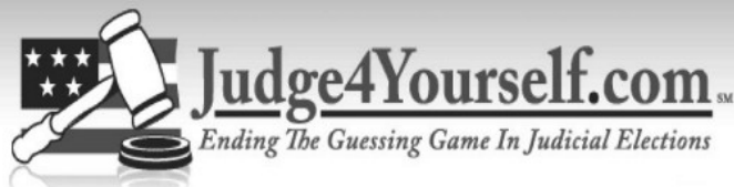
November 7, 2017 Municipality Court Election Judicial Candidate Ratings, 3 and Above

PLEASE REMEMBER TO VOTE FOR ISSUES: YES on 59-Cleveland Port Authority, YES on 60-Cleveland Public Library, YES on 61-Cuyahoga Community College