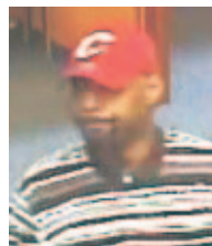
US Bank robbery suspect

In the Huntington robbery, a bank teller told police the suspect came up to her in line and asked about opening a checking account. She told him he would have to wait to talk with a manager. He sat for a while then returned to the line for the teller. The report stated the suspect passed the teller a note demanding money