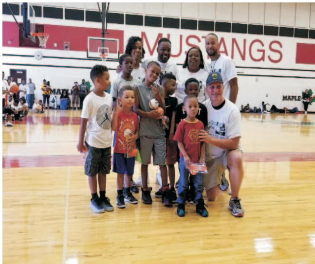
Shown above are participants in the basketball 2017 Hoop it Up Bridge the Gap Campaign held at Stafford Park in Maple Heights on August 5th. The campaign's mission is to "bridge the gap" between youth, city officials and the Maple Heights Police Department.