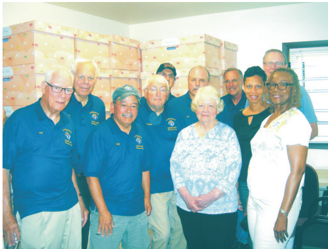
Shown above are members of the Kiwanis Club of South East Cleveland and the Knights of Columbus contingent from St. Bernadette's Church in Westlake, who joined forces recently at University Settlement's Mead House to assemble over 200 safe-sleeping Baby Boxes.

The 3rd annual Save Our Babies Community Awareness event, sponsored by University Settlement, was held last Saturday at Bohemian National Hall in the North Broadway neighborhood of Slavic Village to help combat infant mortality, with about 150 people in attendance.