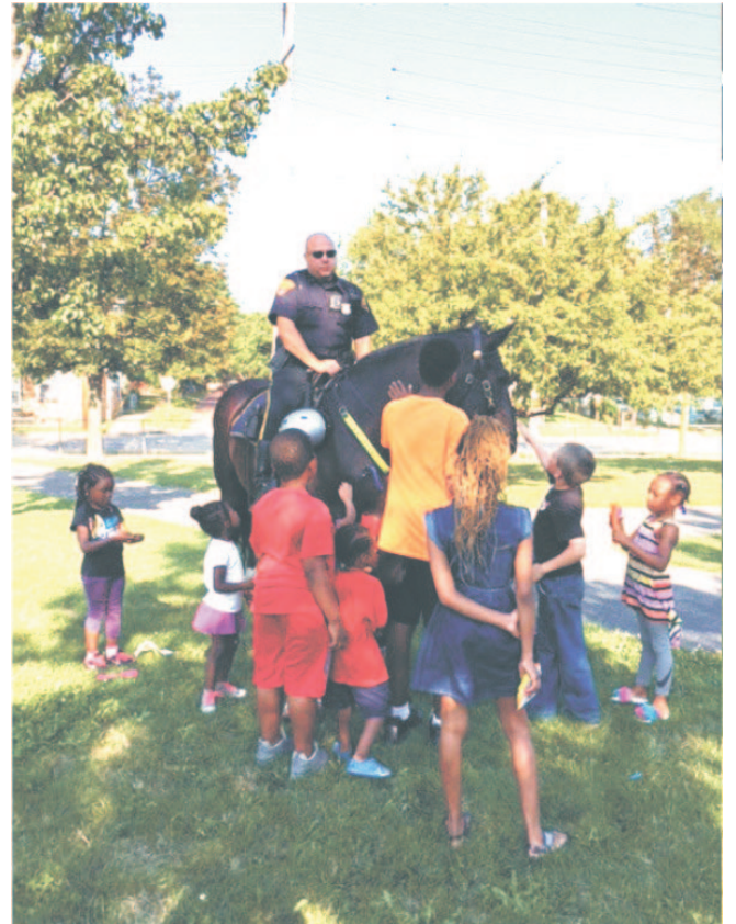
Youngsters in the Hyacinth community are shown crowding around a Cleveland police officer to get a better look at his equine partner at the Cleveland ShowWagon performance last week.

On Tuesday, July 18, the Avenue area of Slavic Village of Cleveland's ShowWagon group performed "Bellarella" at Hyacinth Park in the Francis