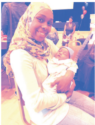
Babies, of course, took center stage last Saturday at the Save Our Babies program at Bohemian Hall.

Experts discussed infant care, with vendors on hand to provide patient education. This free program also distributed about 50 Baby Boxes, along with infant formula and diapers, to parents providing a safe place for their infants, who might otherwise have to sleep with siblings or parents, which can be very dangerous.