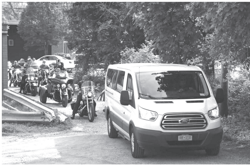
Two GHPD cruisers and 75 motorcyclists provided an escort for the bus with the Wade Park veterans, the entourage shown here entering the American Legion Post 304 grounds last Wednesday.