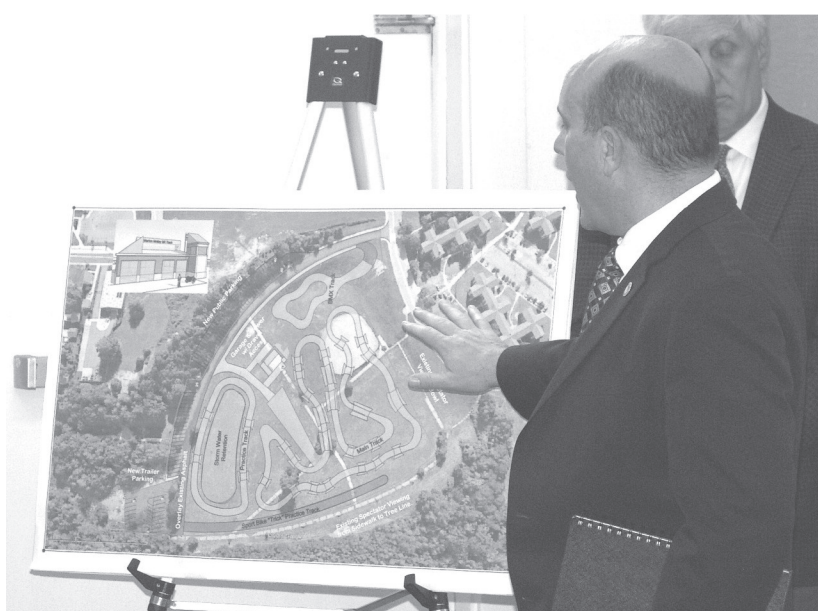
City of Cleveland officials presented plans for a dirt bike track and more in the Kinsman/Garden Valley area of Cleveland at a meeting last week at Elizabeth Baptist Church on Francis Avenue.