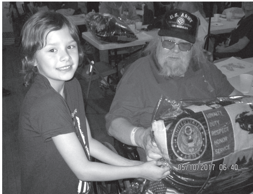
Each veteran was given a pillow made with material from their branch of the service, homemade by the Post 304 Junior Auxiliary, who also handed them out to the appreciative vets.

The fun continued after dinner with musical entertainment and a photo booth by the Rockin' Bluze Brothers out of